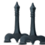
Decorative andirons + Decorative grate (For CTCL24)