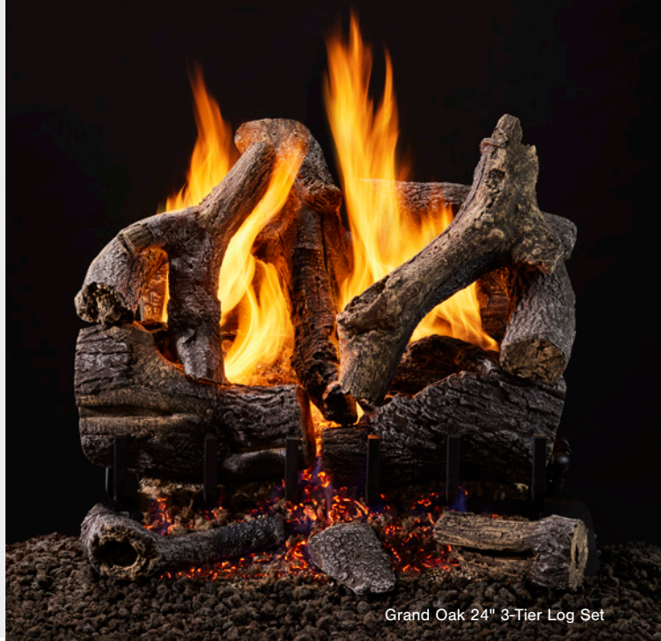
Grand Oak 24" 3-Tier Log Set