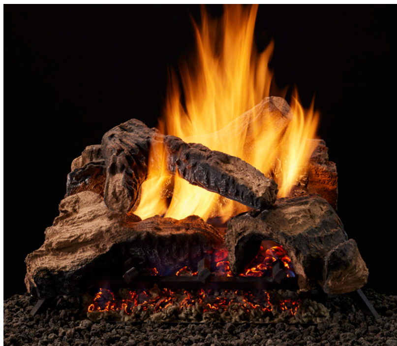
Duzy 2 - 24" Log Set