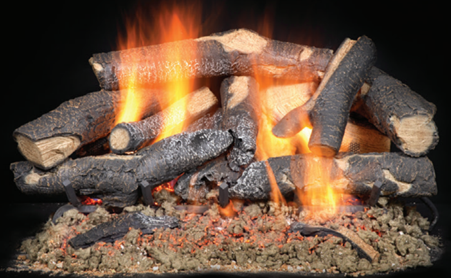
Fireside Supreme Oak - 30" Log Set

For a charred, mature fire, the 12-log Fireside Supreme Oak gas log set is stunningly realistic yet affordable. The detailed concrete logs, molded from real oak, are attractive even when not burning—also in a See-Through model that looks great from either side. In the Duzy 3, durable, glowing logs are convincing while radiant heat technology distributes penetrating warmth with no fan needed.