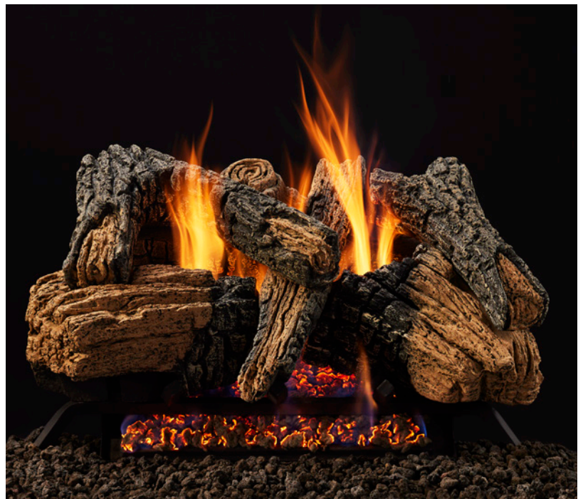
Duzy 3 - 24" Log Set