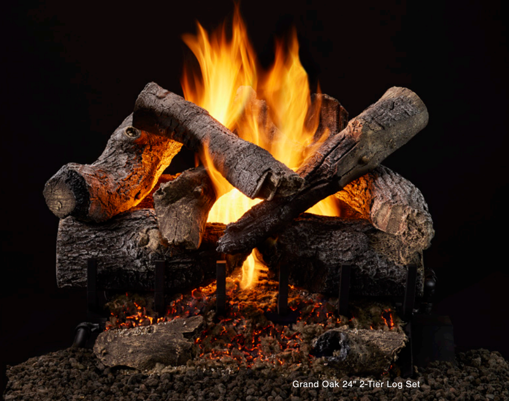
Grand Oak 24" 2-Tier Log Set

For larger fireplaces, the Fireside Grand Oak vented gas log set showcases 11-12 authentic logs from real oak timber molds. An ultramodern burner system creates a multi-level fire. The Outdoor version has such a beautiful fire, friends may ask if they can add a log to it. For gas logs with radiant burner technology, add outstanding realism with the Duzy 5's eight true-to-life ceramic logs, pushbutton ease and Natural Flame™ look.