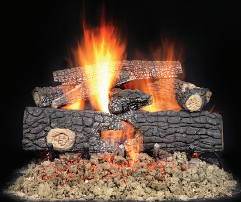
Fireside Realwood - 24" Log Set

Beautiful logs create a beautiful fire, but they don't have cost a lot. The Fireside Realwood gas log set adds bona fide appearance with eight detailed logs at a value price. An Outdoor model features a stainless-steel grate and burner elements to handle the elements. The Duzy 2 fits even narrow wood-burning fireplaces with four ceramic-fiber logs and our patented Natural Flame stainless steel burner, while the Campfire set recreates a natural look with 10-11 ceramic fiber logs.