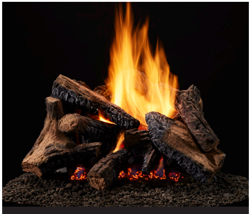
Duzy 5 - 24" Log Set