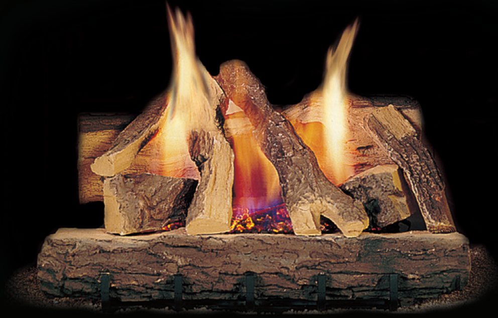
Campfire - 30" Log Set